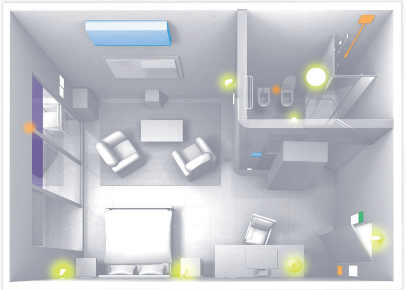
ABB Room Master - Sample Application