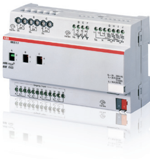
ABB Room Master, Basic