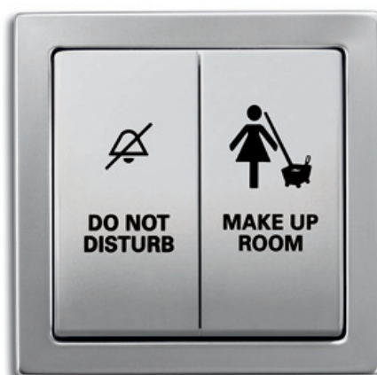
Switch program pur Stainless