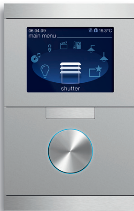
Busch-priOn operating concept

Whether winter or summer, shutters and curtains protect your guests from outside influences and protect their privacy. Modern building control „works with you“ and helps you automate daily routines, offering increased convenience for guests and reduced running costs for you.