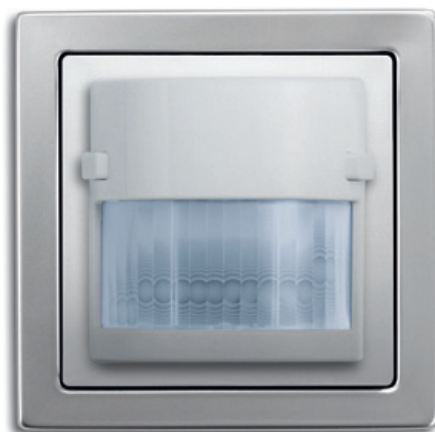
KNX-UP motion detector

Your guests expect you to go to any length to cater to their well-being. The Intelligent building control allows the integration of safety-relevant features above and beyond the stipulated security and safety measures. Increased protection for your operation allows you and your guests to sleep soundly at night.